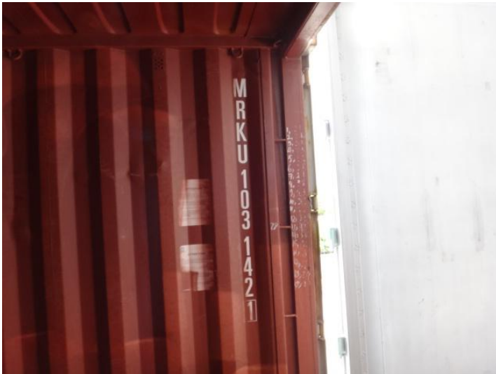
Container No. : MRKU1031421