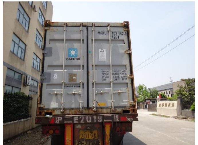
Lock the door