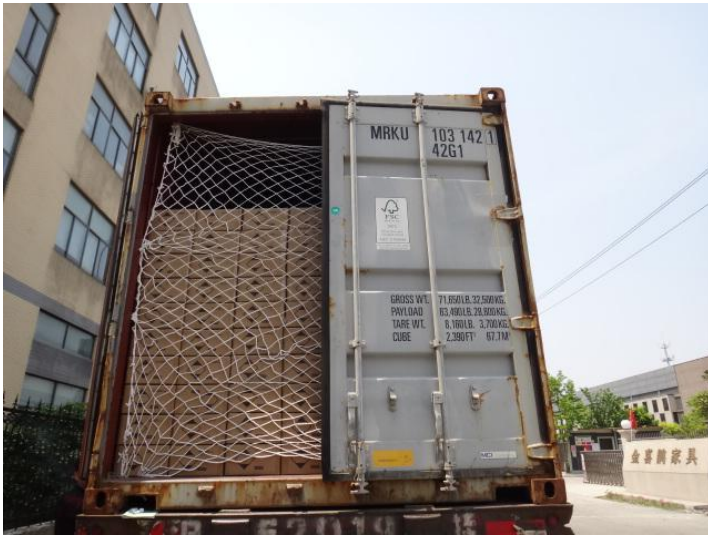
Close the door