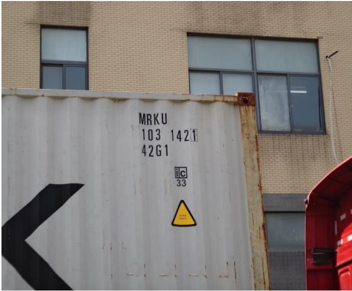
Container No. : MRKU1031421